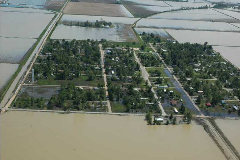
Flood waters surround the town of Canalou, MO.

A total of six CAP aircraft from across the state and more than 30 personnel have provided more than 60 flight-hours including 30 sorties, more than 1,800 man-hours, and hundreds of photographs as well as full-motion video. Mission base for the extended mission was at Spirit of St. Louis Airport in Chesterfield, Mo.