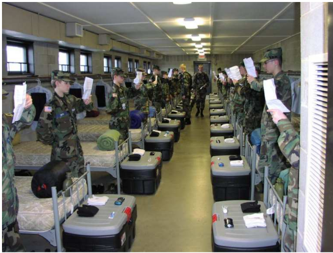
Cadets await a room and BDU inspection during EPS2.