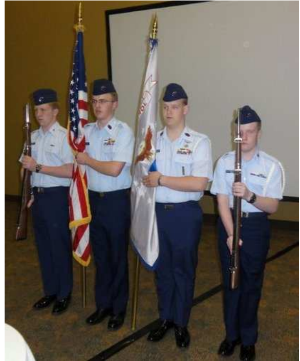
The South Dakota Wing Color Guard presents the colors at the 2011 South Dakota Wing Conference.

Senior members also had meetings on new live streaming video technology for aerial missions, finance, recruiting and retention, professional development, and aircraft maintenance.