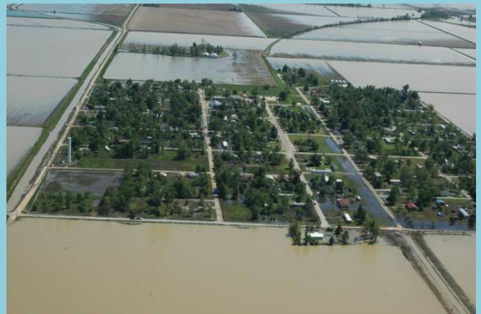
An image of the flooding that has nearly surrounded the town of Canalou, Mo.