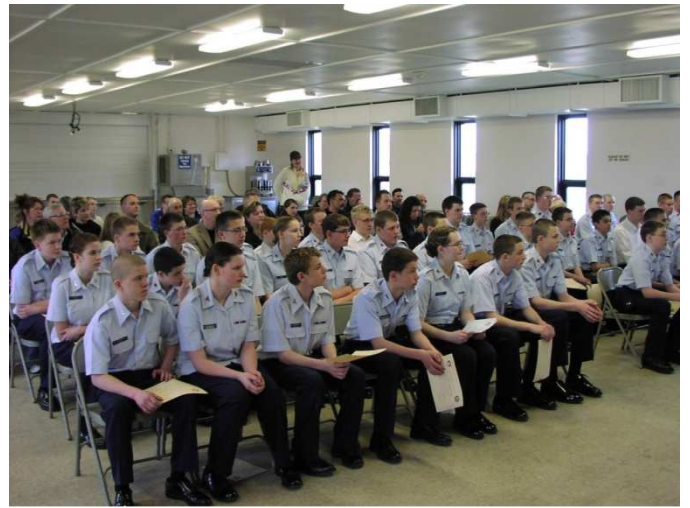
Cadets and families during EPS2 graduation.